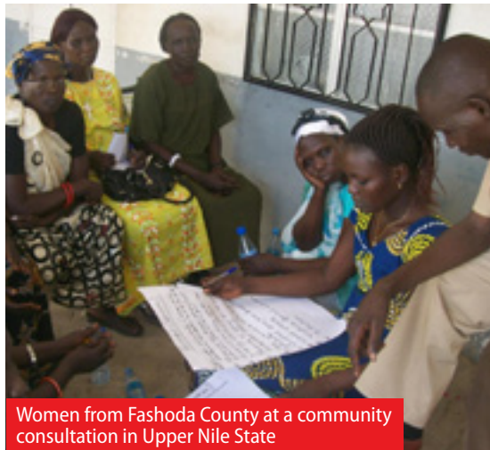
Women from Fashoda County at a community consultation in Upper Nile State