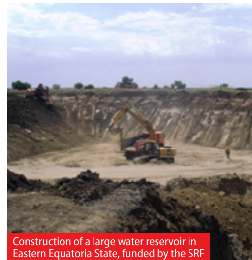
Construction of a large water reservoir in Eastern Equatoria State, funded by the SRF