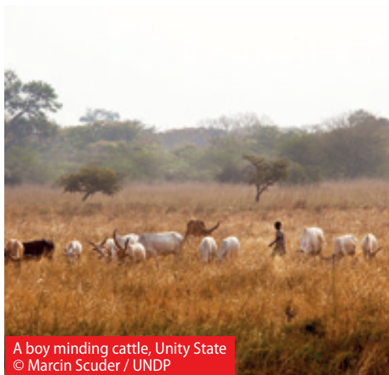
A boy minding cattle, Unity State