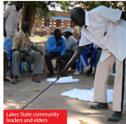
Lakes State community leaders and elders