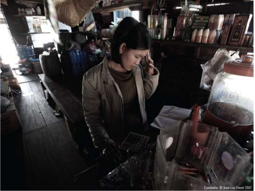
Cambodia © Jean-Luc Fievet 2007

and family for finance, they can issue shares to a wider group of investors and borrow from micro-finance institutions, banks, and, eventually, capital markets. The cost of their capital is much lower, because they can tap a wider pool of finance, creditors have much greater certainty that they will be repaid, and investors can trade their shares more easily. When capital constraints are relaxed, new investments suddenly become possible. Entrepreneurs are able to diversify their risks, and opportunities that would have been missed can be seized.