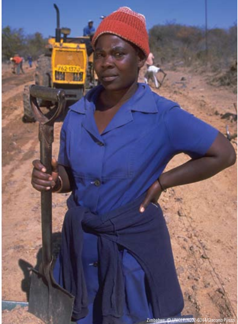
Zimbabwe

The insidious effect of the law's failings on the lives of the poor has long been a theme of great commentators – Charles Dickens, for example, in almost all his novels. Among economists, Douglass North was one of the first to note that the policy prescriptions associated with traditional economic theory failed to capture the nuances and complexities of informal