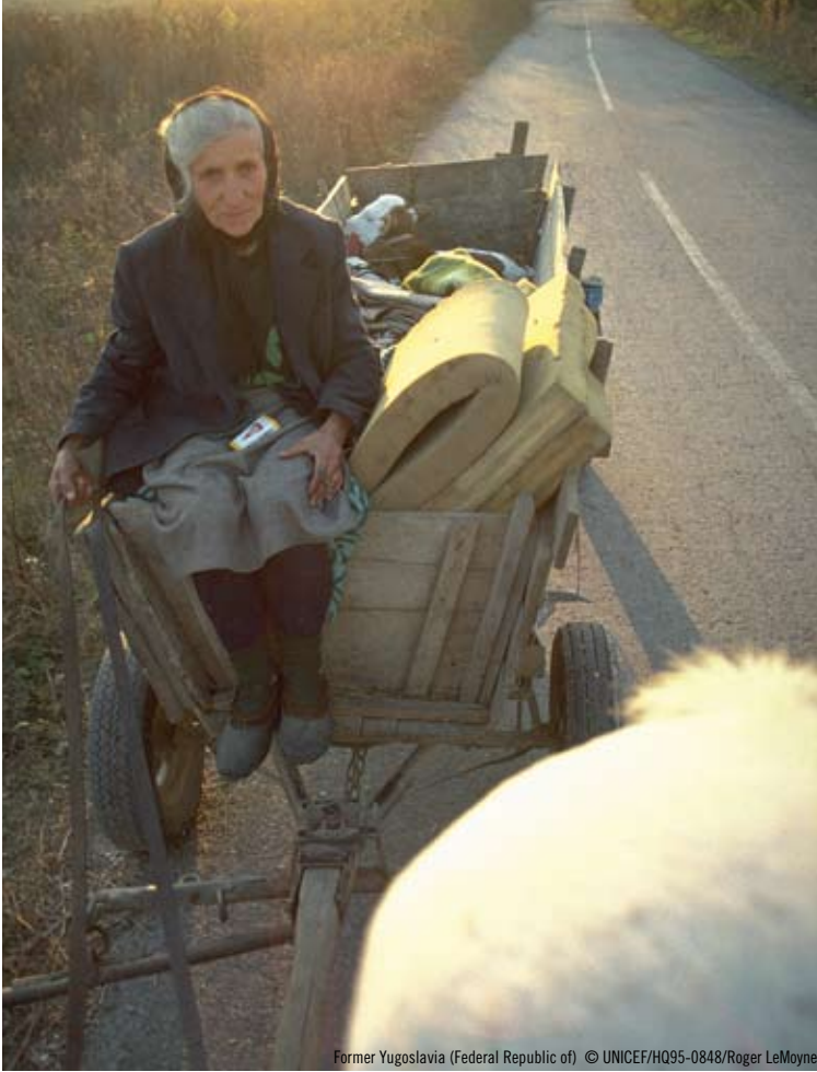
Former Yugoslavia (Federal Republic of)

porting outreach, and, if necessary, bundling registration services with other social services or traditional practices. It will also require creating incentives to register one's legal identity with the state by providing information, working through trustworthy local intermediaries, and minimising any adverse consequences of formal registration. The ultimate goal is not to increase registration rates, but rather to improve access to protections and opportunities. Though distribution of birth certificates alone will not lead to these goals, it is to be understood as